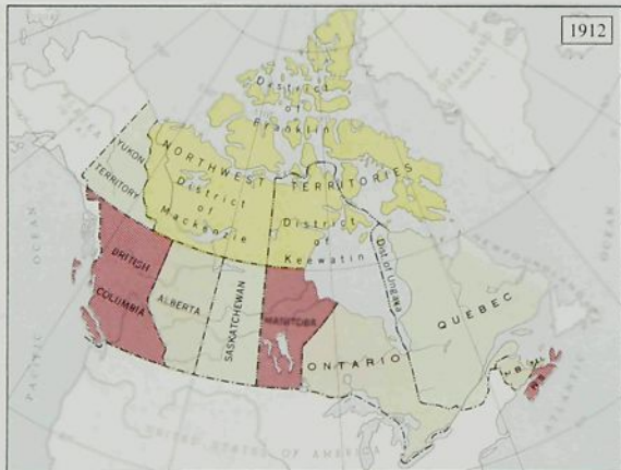
In 1912, the Provinces of Ontario, Quebec and Manitoba were extended northward to Hudson Bay and Strait.